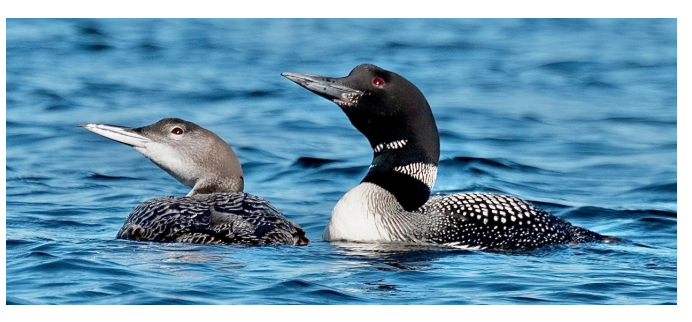
Chick in winter plumage along with its parent. Note that the parent is beginning to exhibit early molting below the beak.

The birds that face the largest hurdles are the chicks. If they do manage to survive the summer, they must migrate, often alone, to the coast. While many chicks reach a comfortably large